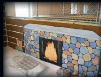
Boarding Suite at Wolf River Boarding Kennel